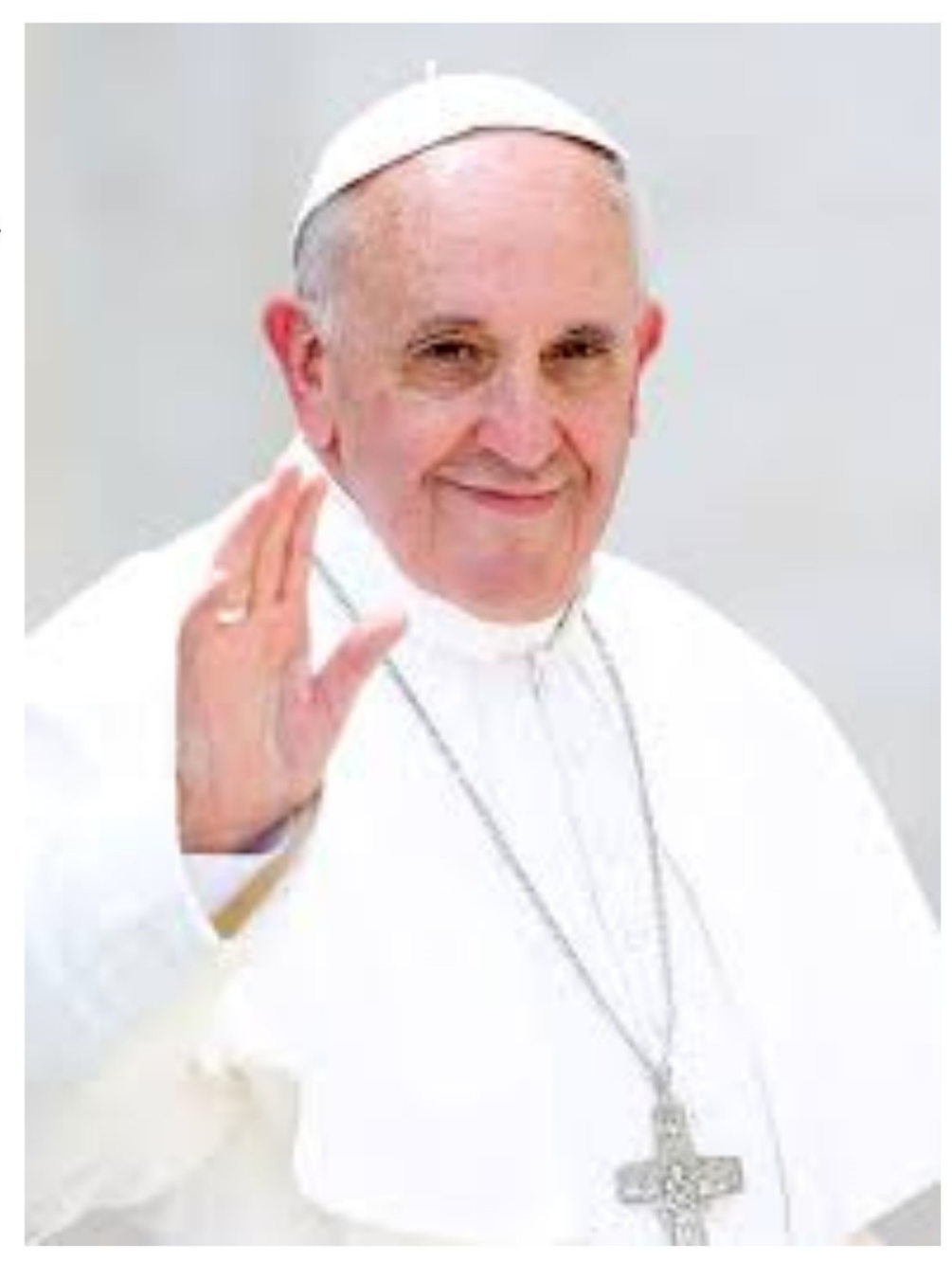
Pope Francis RIP 17 December 1936 -21 April 2025