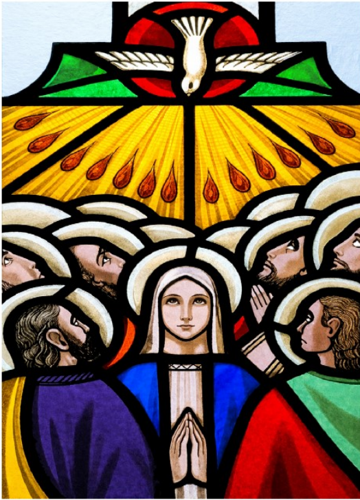
Pentecost, from St John's Church, Carraroe, Sligo