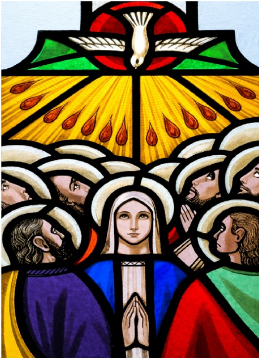
Pentecost, from St John's Church, Carraroe, Sligo