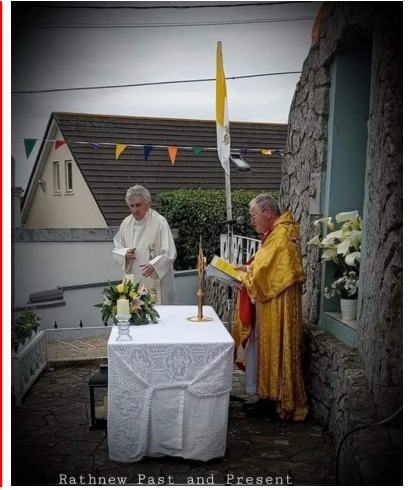
Rathnew Past and Present

Many thanks to the three priests, to all who worked so hard to make it such a success and to those who provided the refreshments in the hall afterwards.