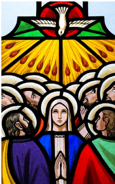
Pentecost, from St John's Church, Carraroe, Sligo