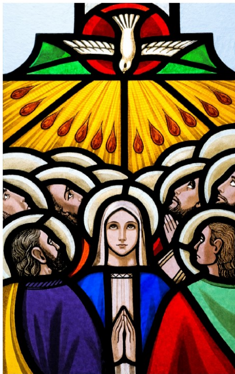
Pentecost, from St John's Church, Carraroe, Sligo