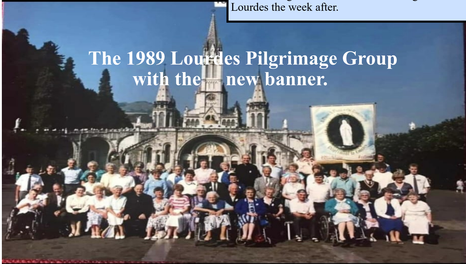
The 1989 Lourdes Pilgrimage Group with the new banner.