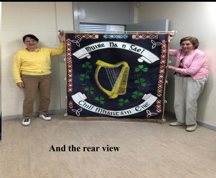
And the rear view