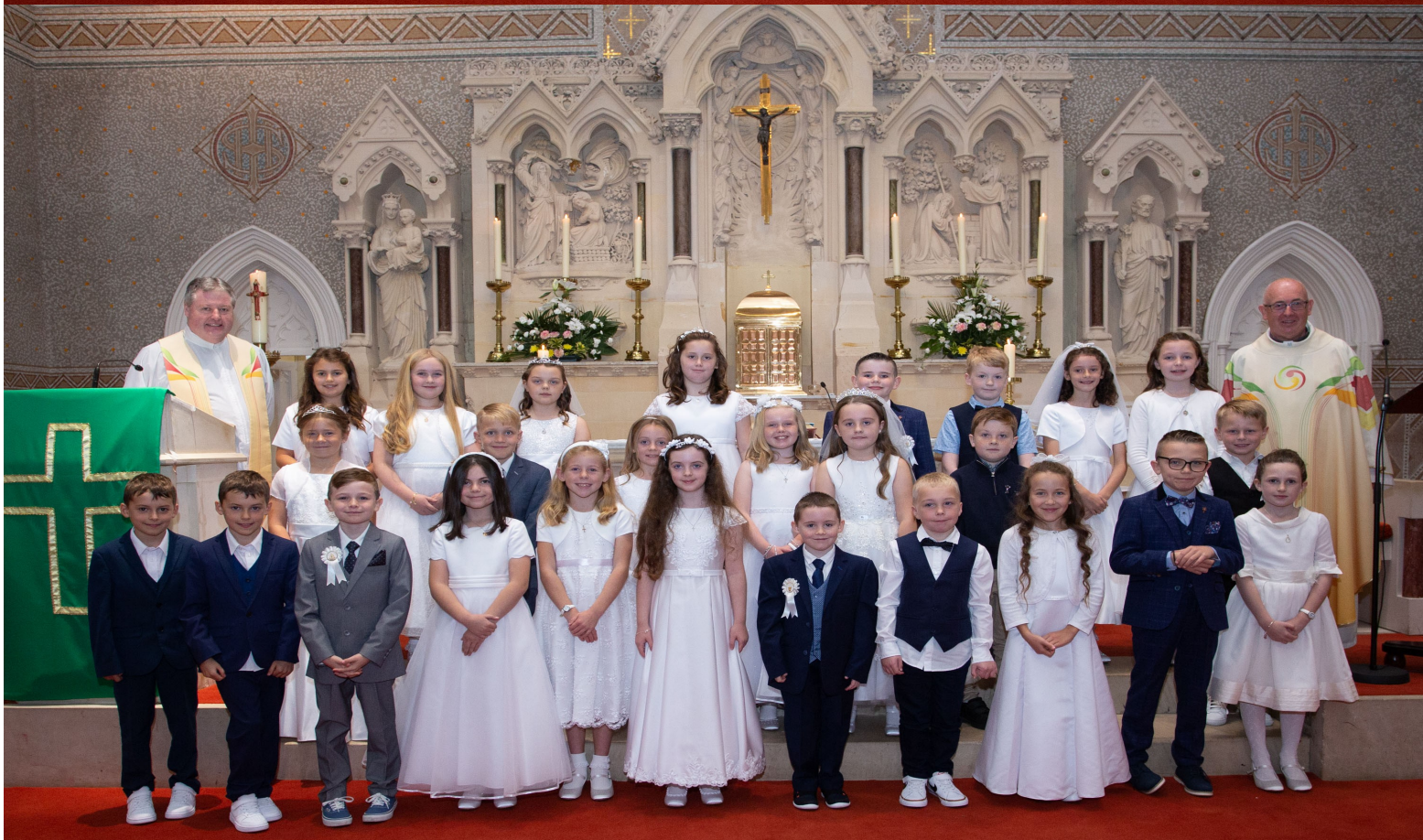
First Holy Communion children ~ 18th September 2021 ~ 11.30am Mass