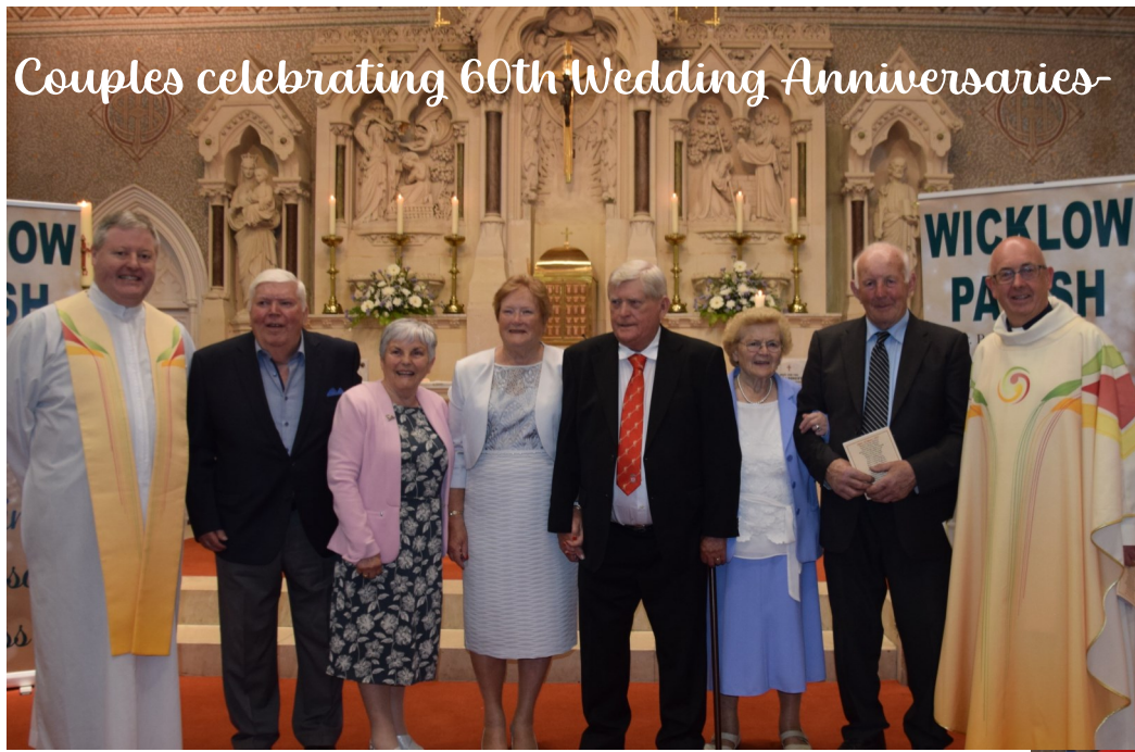
Couples celebrating 60th Wedding Anniversaries-