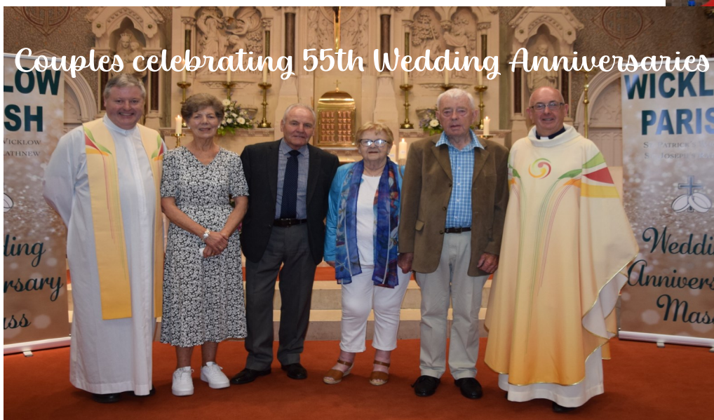
Couples celebrating 55th Wedding Anniversaries