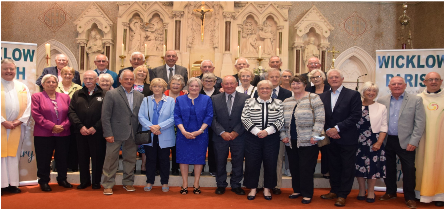
Couples celebrating 50th Wedding Anniversaries